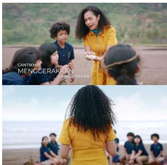
Figure 5. Scene 4: Appearance of the Third Figure, a Teacher ( shot time 0:28 - 0:32)

When associated with the theory of social reality construction, the results of the research in these three scenes show the body image presented following their characteristics based on appearance, costume, and makeup that has an ideal body such as a smooth face, slender body, thin lips, white teeth, and a face inseparable from makeup which in this scene also promotes that by using Wardah products, women's beauty can go anywhere. However, they also show behavior, gestures, and expressions that show how a woman is able to appear brave and confident with the works she produces and the profession she lives, in line with the audio in the form of voice-over, which is constructed in this scene that women can drive change and are able to move others starting from within themselves. These three scenes mean that body image is not just about having an ideal physical appearance, it must also have the value of inner beauty.