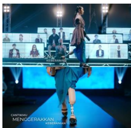
Figure 1. Ad snippet of Wardah Beauty Moves You #MoveBringBenefits (Wardah Beauty, 2021)

Regarding the display of women's body image in advertisements, the images displayed to the community is that which show the beauty of women's physical form, how women look perfect with their ideal bodies such as tall stature, fair-skinned, slim figure, and flawless facial skin complexion. Just like the Wardah brand, which in every advertisement always depicts beauty with an ideal figure following the beauty standards that have been formed in society, which always depicts beauty through the image of the female body with a figure that has an ideal body. Then, in every advertisement, Wardah always emphasizes the figure of a Muslim with a polite, closed outfit, namely wearing a headscarf.