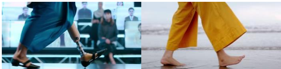
Figure 8. Scene 7: Leg Comparison Rendering (shot time 0:51 - 0:52)

When associated with social reality construction theory, this scene concludes a meaning that is communicated through appearance, behavior, gesture, make-up, and expressions displayed in real conditions with an appearance that shows her characteristics as a disability, the behavior she displays illustrates high self-confidence with a gesture of stepping boldly in front of the audience, without the barrier of fear she expresses herself with a smile, in harmony with the audio in the form of voice over which is constructed in this scene that women are able to move courage. The meaning inferred from this scene is that the disabled woman is able to break the circulating belief that the body image is not like what the wider community thinks of an ideal body, but also from the limitations of the body that can be seen from her profession that is able to move courage and has the value of inner beauty from her confidence.