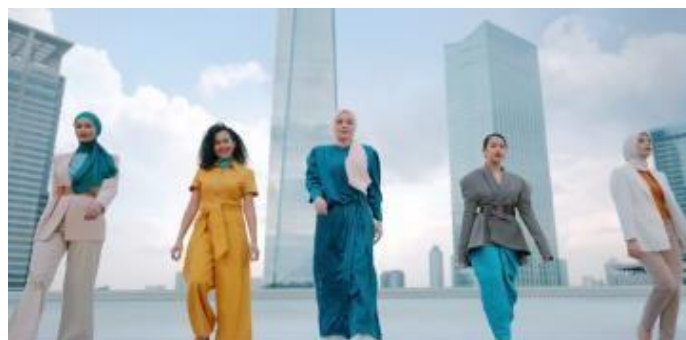
Figure 9. Scene 8: Reappearance of Five Female Figures ( shot time 0:52 - 0:53)

When associated with the theory of social reality construction, the results of the research in this scene show that women appear according to their respective characters, where the body image depicted is not what the wider community thinks about a proportional physical form, but from the character of the body that is seen wearing a prosthetic leg, and also from the inner beauty that has the courage to appear according to their character, in line with the audio in the form of voice over which is constructed in this scene that with her limitations she is still able to bring benefits to both herself and others through the profession she is living in, not looking at her limitations but continuing to move forward with courage that appears according to her character.