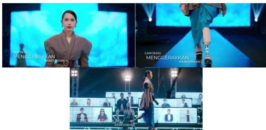
Figure 6. Scene 5: Appearance of the Fourth Figure, a Model with a Disability (shot time 0:35 - 0:39)

When associated with the theory of social reality construction, this scene is highlighted through visualization of appearance, behavior, gesture, and expression, which shows the body image of a woman with curly hair, honey skin color, and behavior that is consequently good at creating a learning atmosphere for children, in line with the audio in the form of voice over which is constructed in this scene that women are able to move steps for the future starting from the way she helps children's development by providing knowledge. This scene means that body image is not only seen from the ideal physical appearance but also from the uniqueness of her body characteristics, and she is able to have the value of inner beauty.