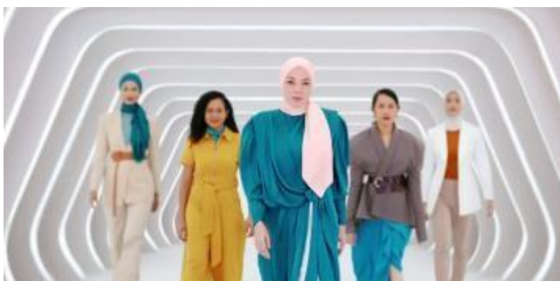
Figure 2. Scene 1: Appearance of the Five Female Figures (shot time 0:04 -0:05)

The body image displayed in this Wardah advertisement is made based on the reality in society, where this advertisement represents the meaning of a very different body image, namely with several different characteristics, including an ideal physical appearance with a smooth face, slender body, thin lips, white and regular teeth. Then, with a body character that looks unique, such as curly hair, besides that with the character of an Islamic woman wearing a hijab. Moreover, by equalizing disability rights by displaying the identity/body characteristics that use prosthetic limbs.