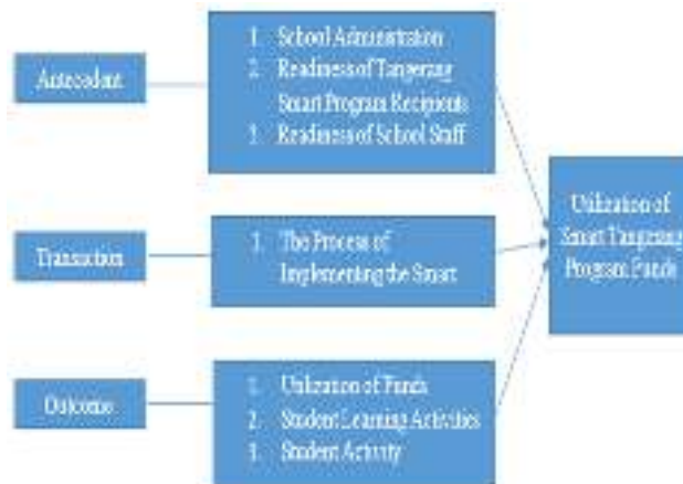
Figure 2: Evaluation of the countenance stake in the Smart Tangerang Program

In general, the process of implementing the Smart Tangerang Program in Tangerang City can be categorized as good or effective because it is in accordance with the Mayor's Regulation concerning the Smart Tangerang Program (PTC) as a technical guide which is the basic standard and reference in implementing PTC. As previously stated, the results of this study use the Countenance Stake model which consists of three aspects, namely aspects of PTC recipient readiness (antecedents), aspects of PTC implementation (transactions), and aspects of PTC utilization (outcomes). The following is a picture of the countenance stake evaluation in the Smart Tangerang Program in Figure 2.